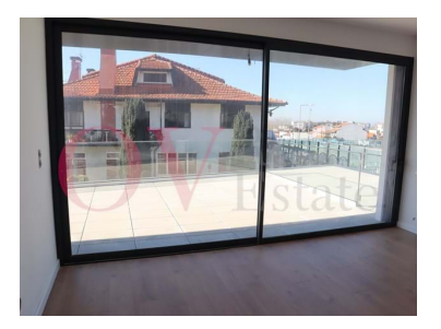
= 2 Bedrooms